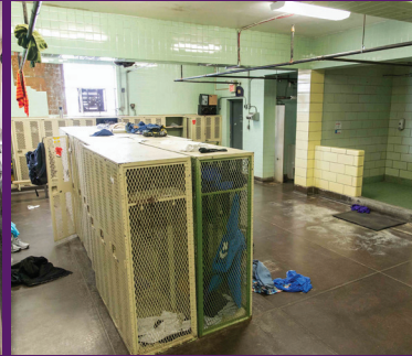
HS boys locker room under Moore Gym