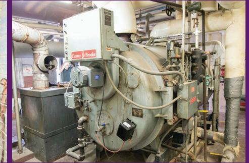
1911 Lincoln Elementary, boiler beyond its useful life

As you make your decision on the future of our education path, here are some important facts to know about the new referendum.