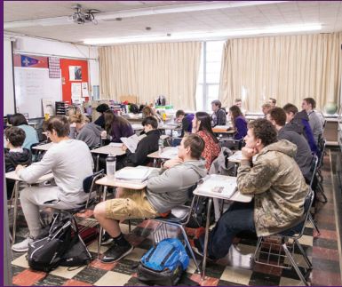
HS social studies taking place in Washington Elementary classroom