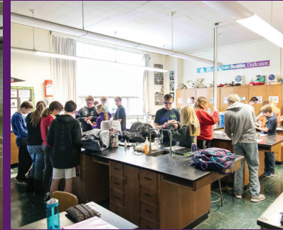
1923 HS science lab